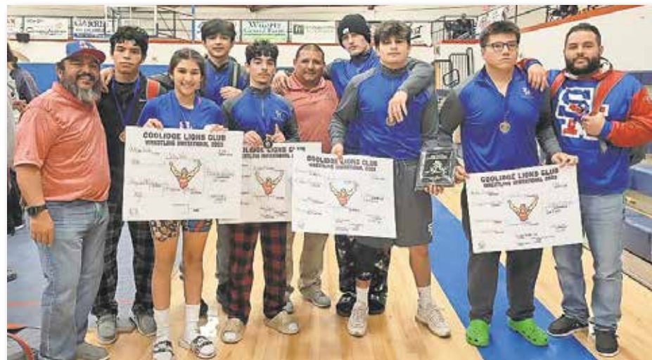
San Manuel High School Miner Wrestling Team.

The Miner wrestlers will travel to Catalina High School to compete in a multi-meet on Wednesday, Jan. 18.