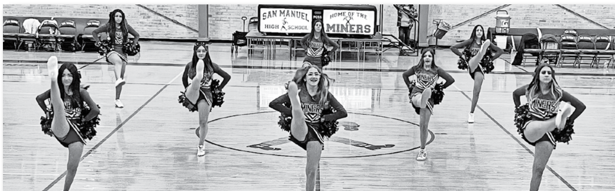
The San Manuel Junior High School Cheerleaders entertain the crowd at the high school basketball game.