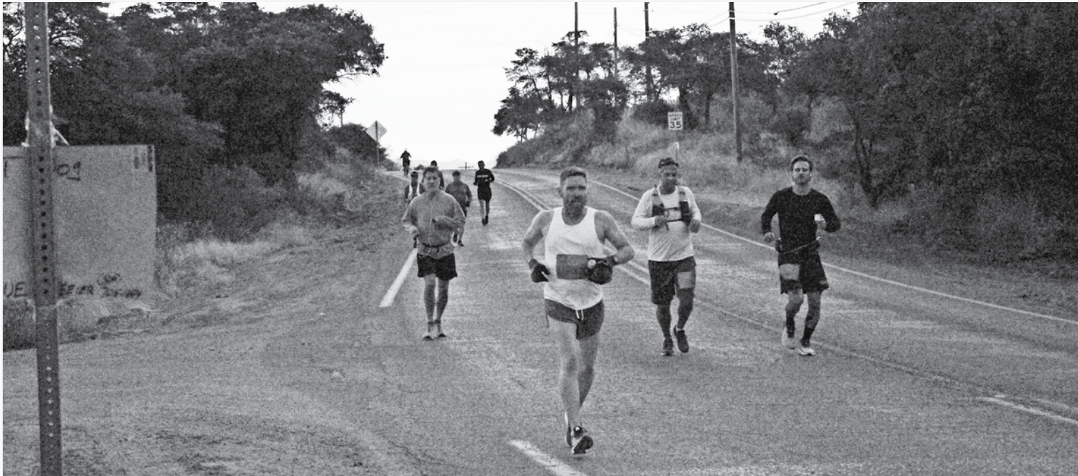
The runners come over the hill heading into Oracle during the 2021 Tucson Marathon.