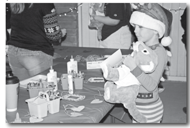
Ray Bearcat PTO's booth featured Build-A-Bearcat.