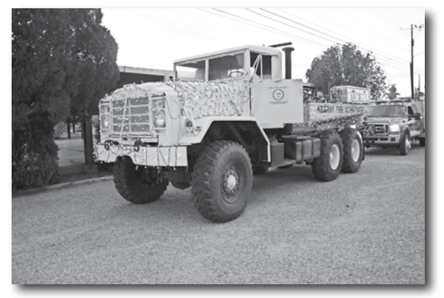
Kearny Fire Department's entry in the light parade.