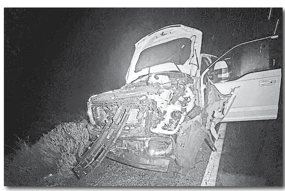
The front end of this Ford F350 took the brunt of the truck vs. cow accident.

Just after 7 p.m. on Saturday, Dec. 3, emergency crews responded to a report of a vehicle accident involving a cow near milepost 121 on Highway 77 between Mammoth and Aravaipa.