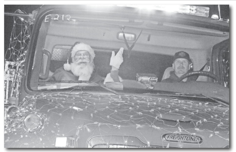
Santa Claus will make a pre-season appearance in Superior this Friday at the annual Miracle on Main Street.