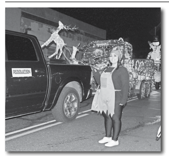
Decorated vehicles, ugly Christmas sweaters and raffles: so many fun things to do at Miracle on Main St.