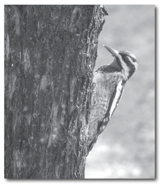
Red-naped Sapsucker.

As daylight hours shorten and temperatures drop, a hint of Winter is in the air at Oracle State Park. Summer grasses have turned golden, trails and washes