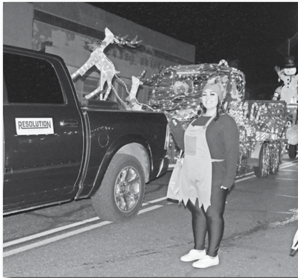
Decorated vehicles, ugly Christmas sweaters and raffles: so many fun things to do at Miracle on Main St.