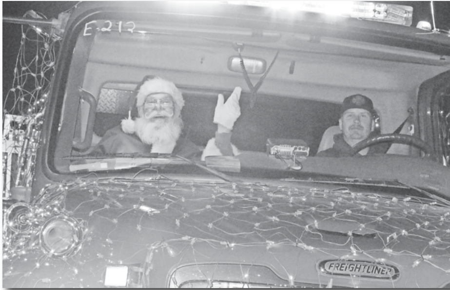
Santa Claus will make a pre-season appearance in Superior this Friday at the annual Miracle on Main Street.