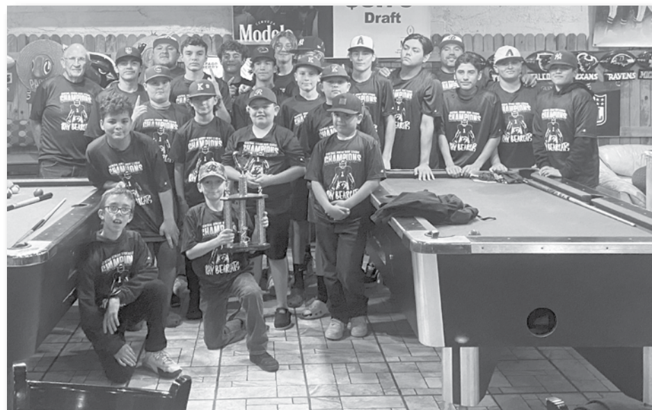
The Ray Junior High School Football team with the championship trophy.