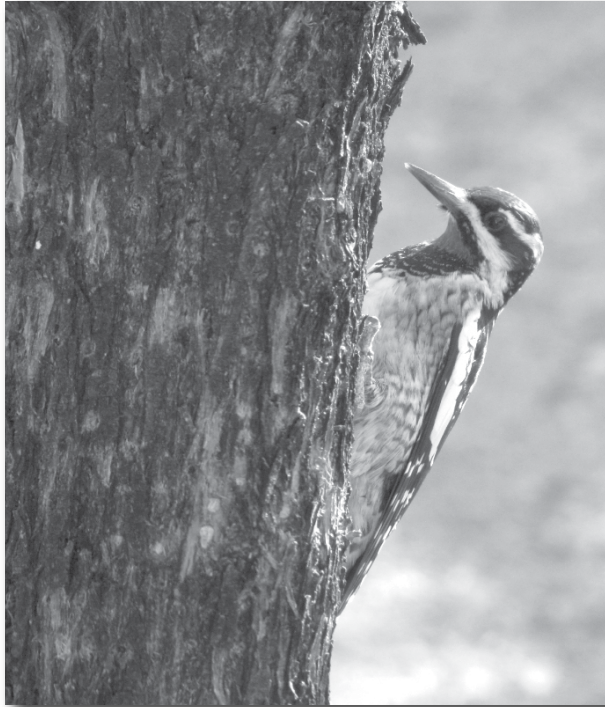
Red-naped Sapsucker.

As daylight hours shorten and temperatures drop, a hint of Winter is in the air at Oracle State Park. Summer grasses have turned golden, trails and washes