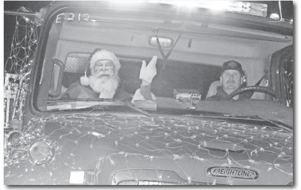
Santa Claus will make a pre-season appearance in Superior this Friday at the annual Miracle on Main Street.