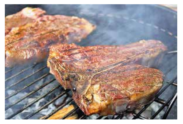
Beef T-Bone Steaks Premium Selected Great for a Winter Barbeque! $6.99/1b

Beef Rib-Eye Steaks ......$7.99/lb Premium Selected