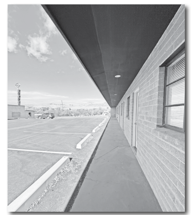
The Copper Bottom Apartments are providing some much needed housing in Superior.

The developers plan to remodel and repair the old Ritchies Bar into an event venue and they hope to begin construction on that in early 2022. The venue will be available for parties and meetings.