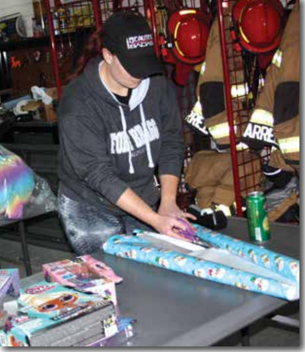
Folks were busy Thursday evening at the Kearny Fire Station wrapping Christmas gifts to be distributed before Christmas.