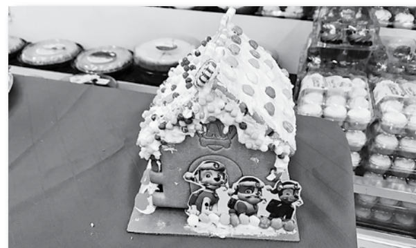
Third Place – Puppy Dog Pals