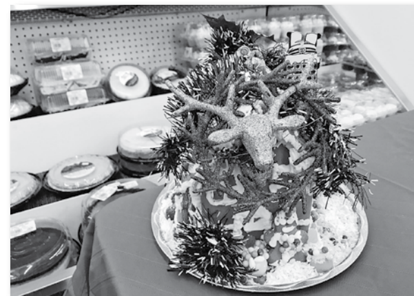
Second Place – Tonya Burton (Elf's Cottage)