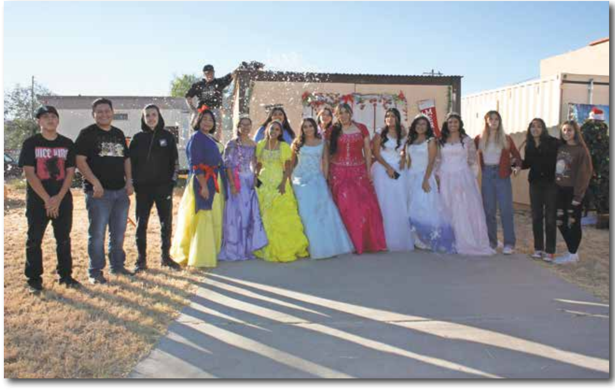
Hayden Junior Chamber members and princesses.