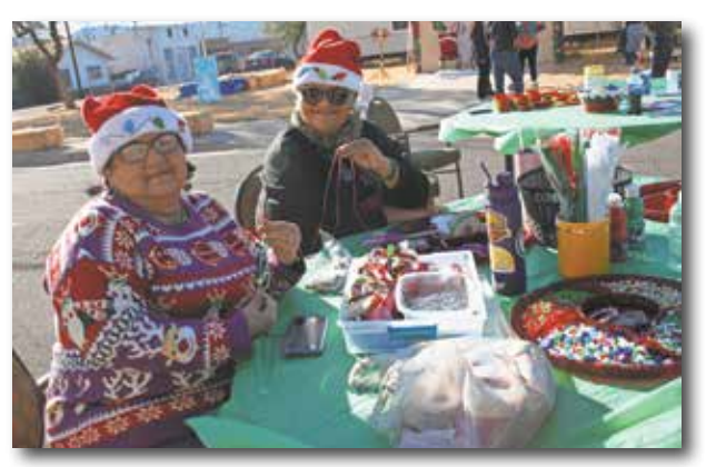
These ladies helped with Christmas crafts.