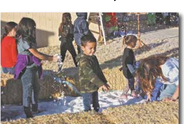
Kids had fun playing in the snow.