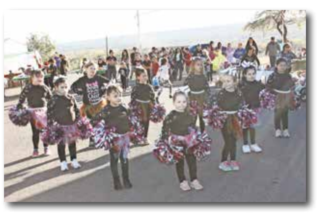
Kearny Pink Ladies Cheer Team.