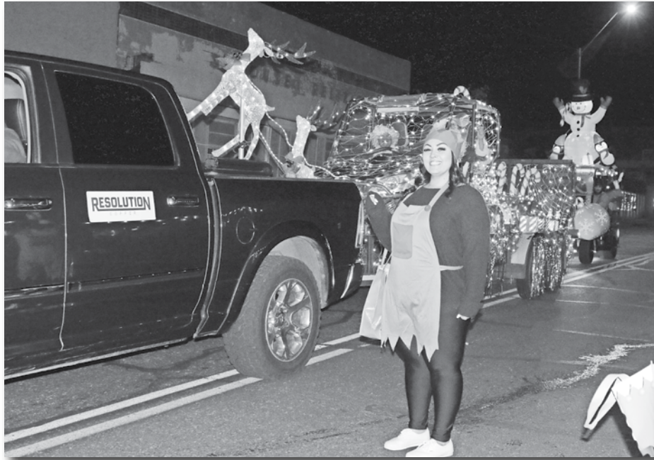
Resolution Copper's parade entry.