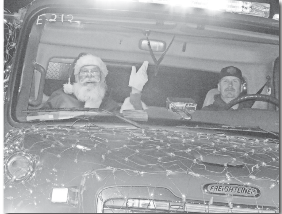
Santa arrives in his Superior Fire Department sleigh.