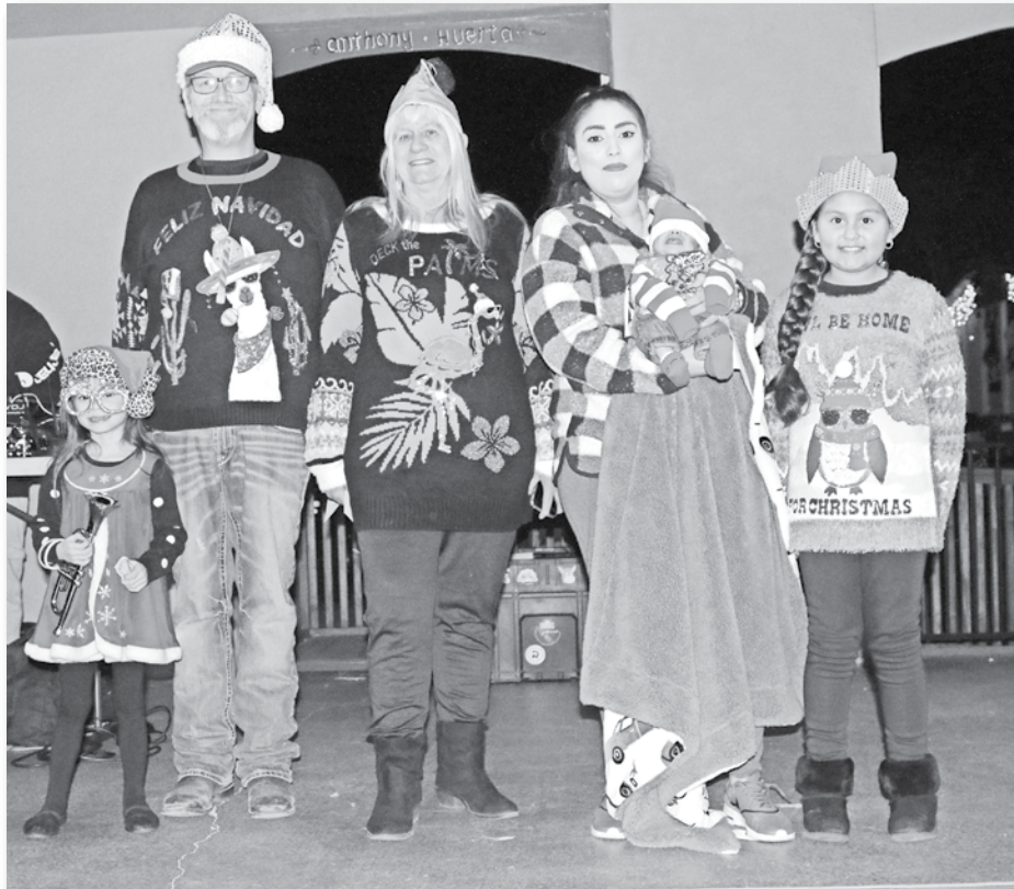
Ugly Sweater contest winners.