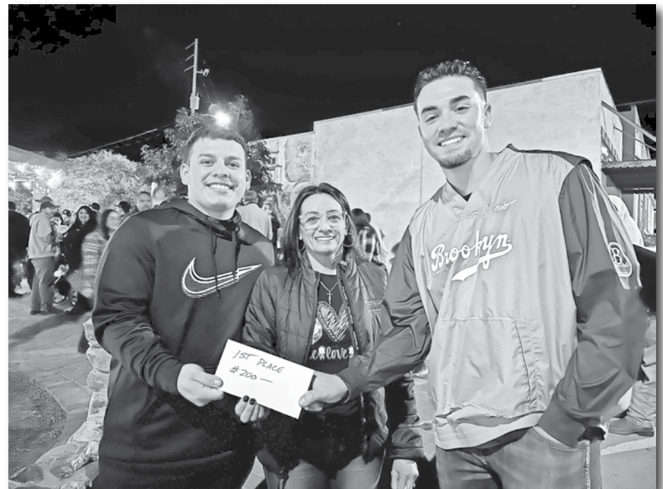
Resolution Copper representatives donate back the prize money from winning first place in the float contest.