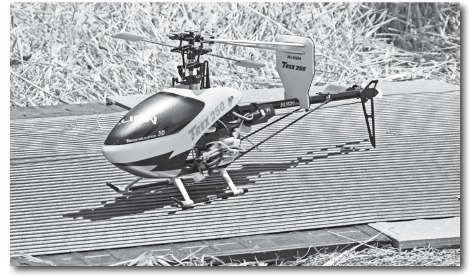
Flyers like these will be taking over the airspace at the Superior Municipal Airport this weekend.

Friday, Nov. 11, through Sunday, Nov. 13, and is hosted by the Superstition Radio Control Helicopter Society and the Town of Superior.