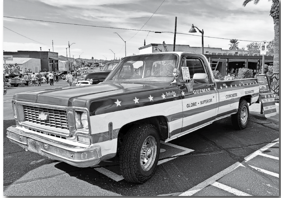
Mila Besich | Superior Sun