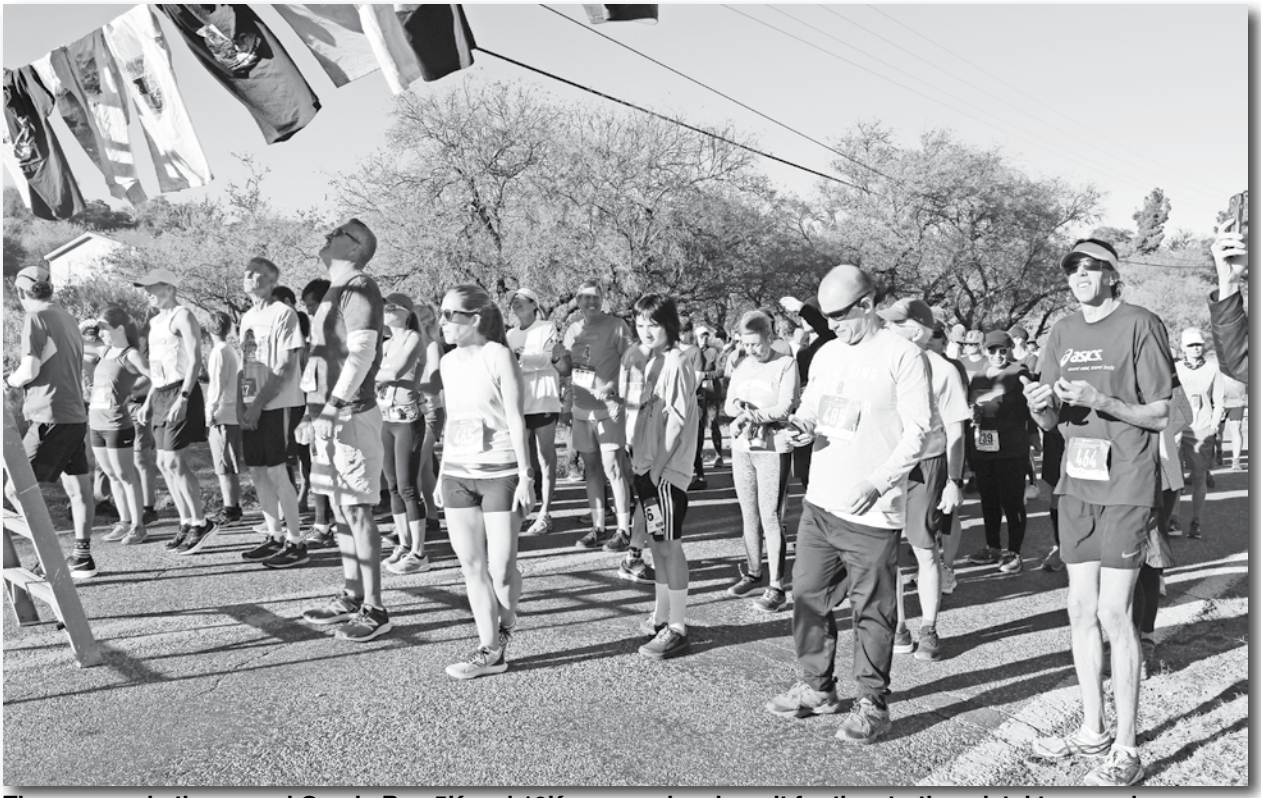
The runners in the annual Oracle Run 5K and 10K race anxiously wait for the starting pistol to sound.