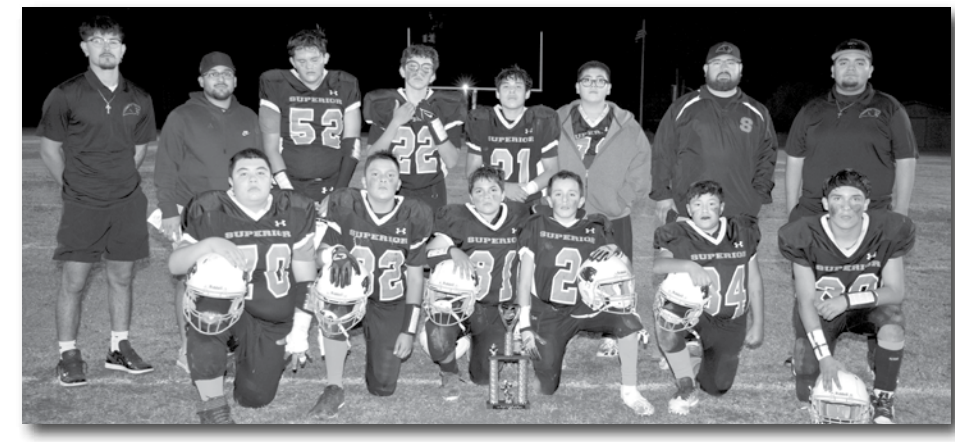
Superior Junior High School Panthers are the 2023 CJHL Runners Up.

11/8/23, 11/15/23 CNS-3754646# SAN MANUEL MINER MINER Legal 11/8/23, 11/15/23