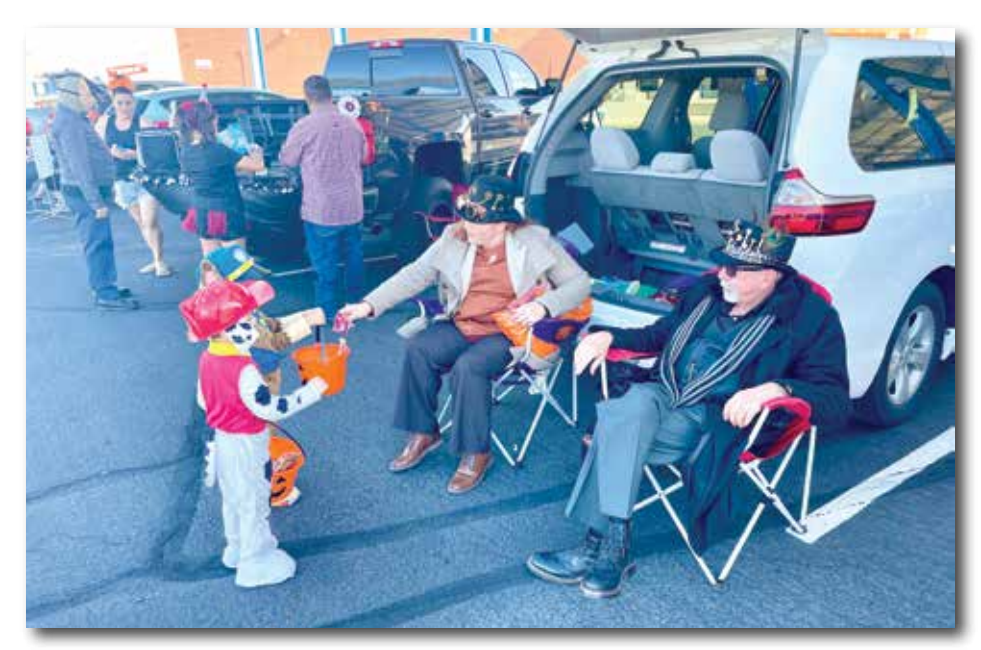
Tri-Community members came out on Oct. 28 to enjoy the sunshine and time together. The wind did not dampen the Halloween spirits of the ghouls and goblins as they gathered up candy and other tasty goodies at the San Manuel Schools parking lot.

San Manuel Trunk or Treat brings the community together