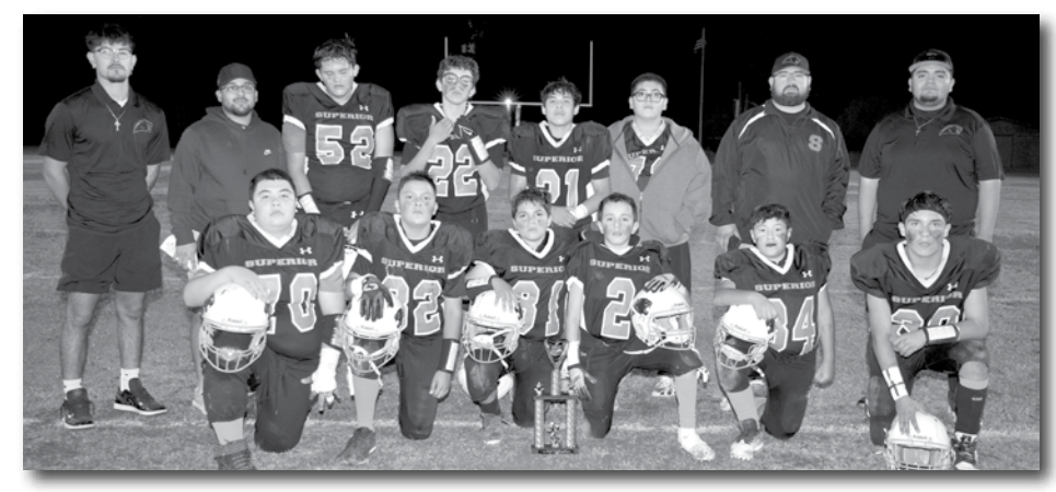
Superior Junior High School Panthers are the 2023 CJHL Runners Up.

11/8/23, 11/15/23 CNS-3754646# SAN MANUEL MINER MINER Legal 11/8/23, 11/15/23