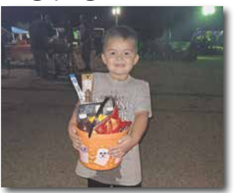
This little guy raked in a bunch of yummy goodies at the Haunted House.