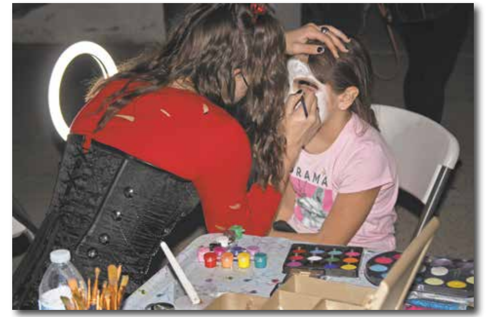
Face painting was popular at the Winkelman Halloween event.