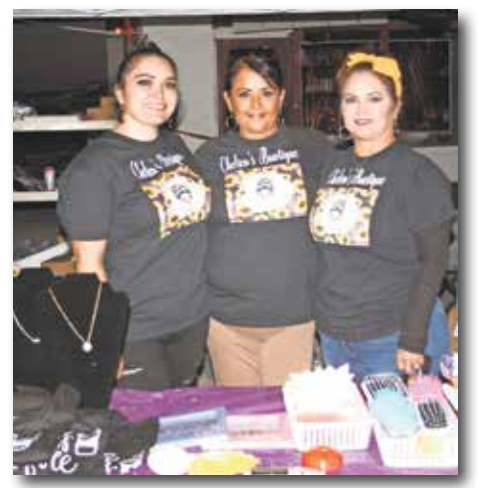
Chelsea's Boutique, a local vendor, was open for business at the Winkelman Haunted House.