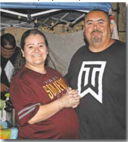
Motto's Famous Fish-n-Chips was a popular vendor at the Winkelman Haunted House.