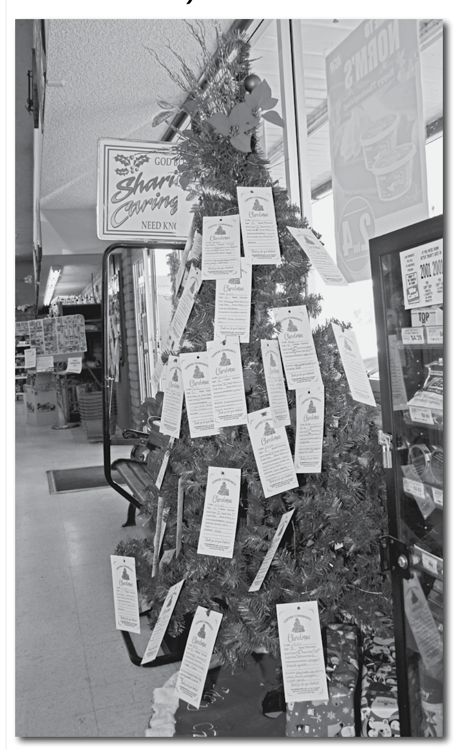
You, too, can be a Christmas angel. Copper Community Christmas tags are available at Norm's IGA in Kearny. Drop off donations are at Norms IGA, Kearny, Hayden, Winkelman and Dudleyville Fire Stations.