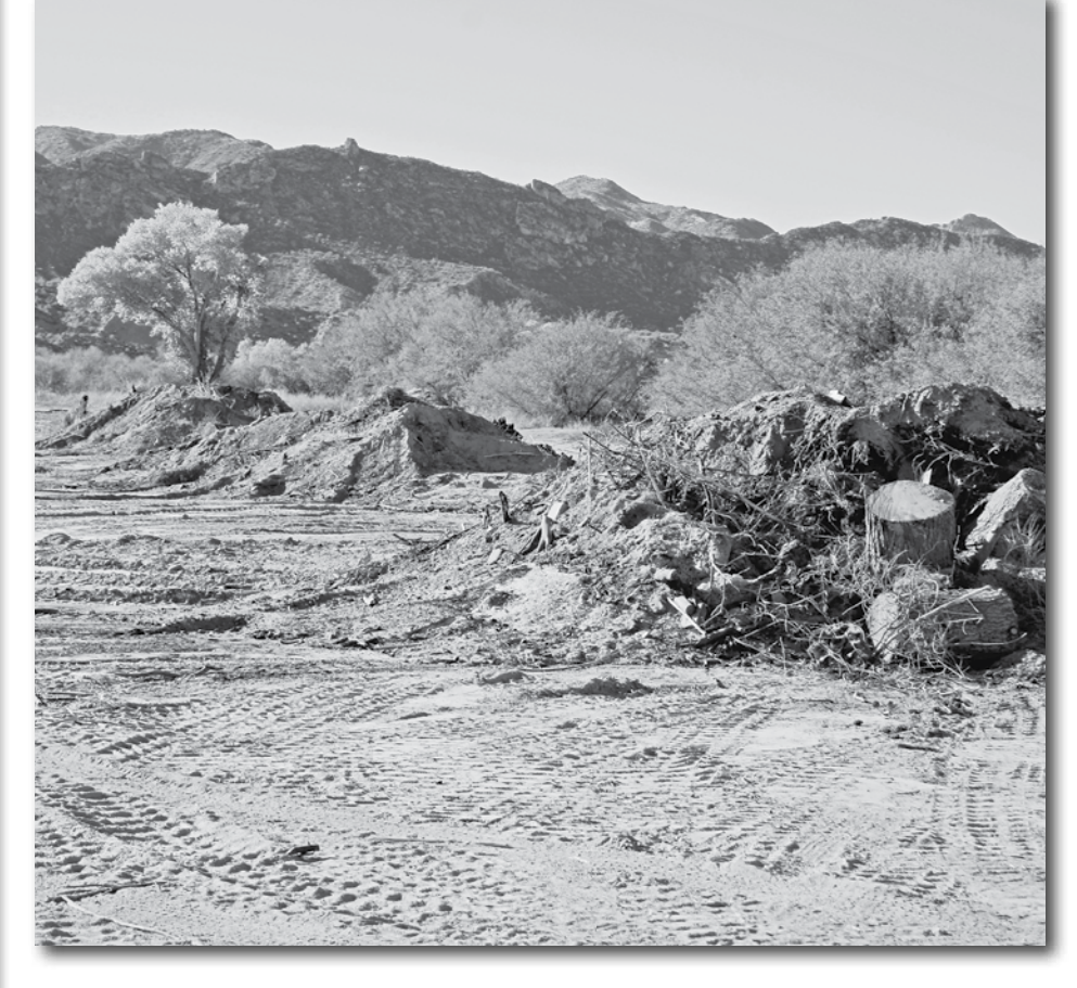
The burn pile for limbs and other burnable material for local residents has been moved off the golf course area and is now located behind to golf course in Kearny.