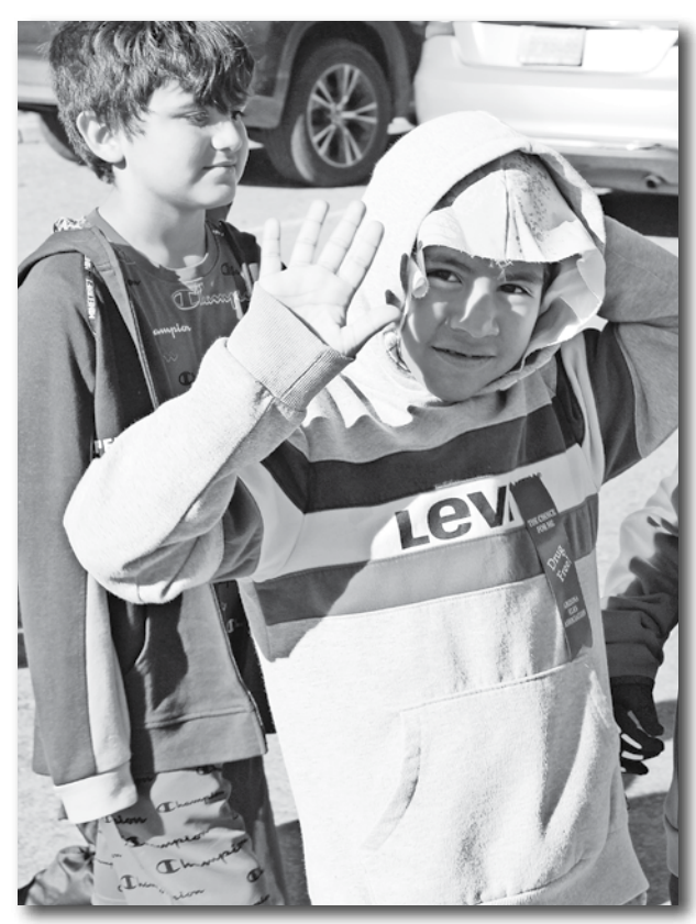
Students at Mammoth-San Manuel Pre-K-12 School joined other students nationwide in a walk for Red Ribbon Week, pledging to remain drug free.