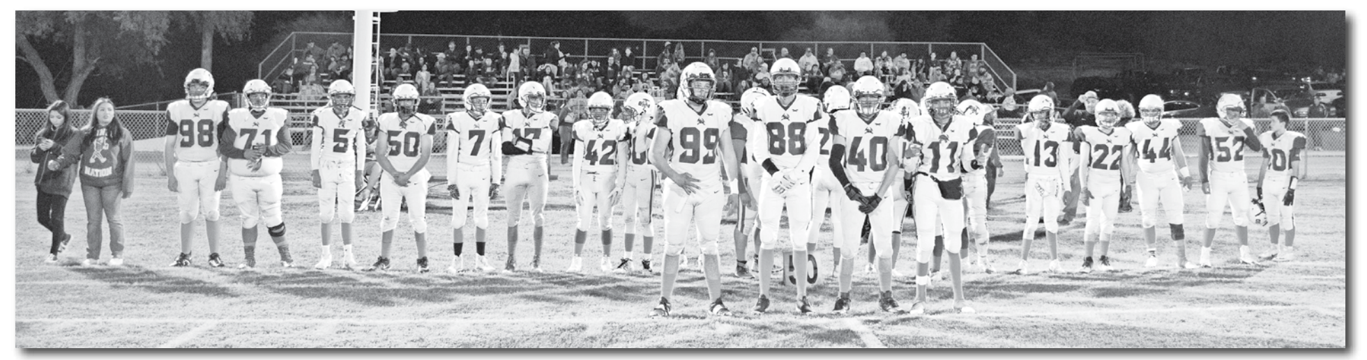
San Manuel's football team on the Hayden Lalo Serrano Football Field.