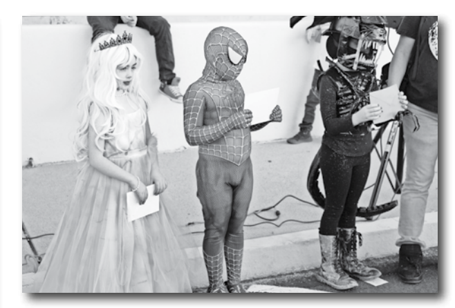
Third, fourth and fifth grade winners of the costume contest at the trunk or treat.