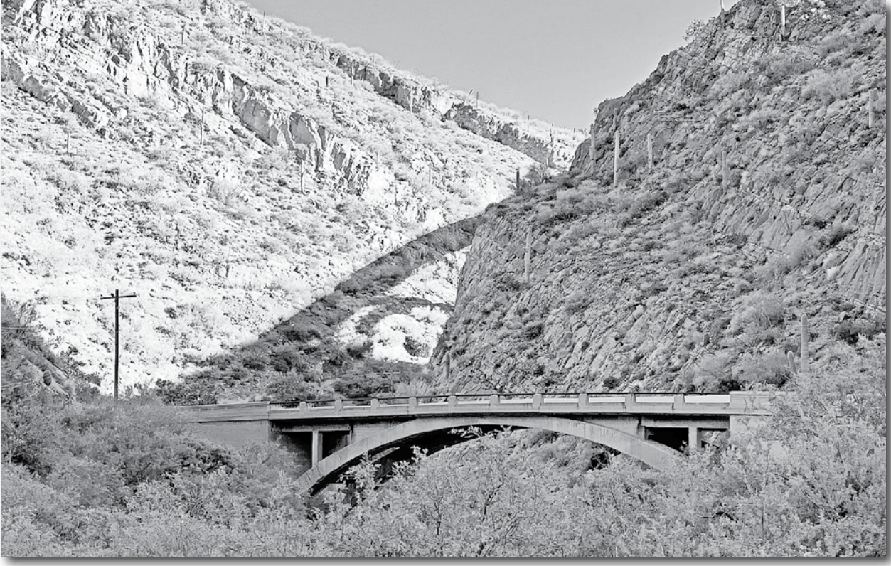
The old bridge over the Queen Creek near Superior. The shadow of the current bridge looms. In a couple of years there will be three bridges.

Obituaries are published free of charge in the San Manuel Miner. If you have an obituary you would like us to print, please submit it online at copperarea. com. Click on "Customer Service". You can also request our newspaper through the mortuary or funeral home.