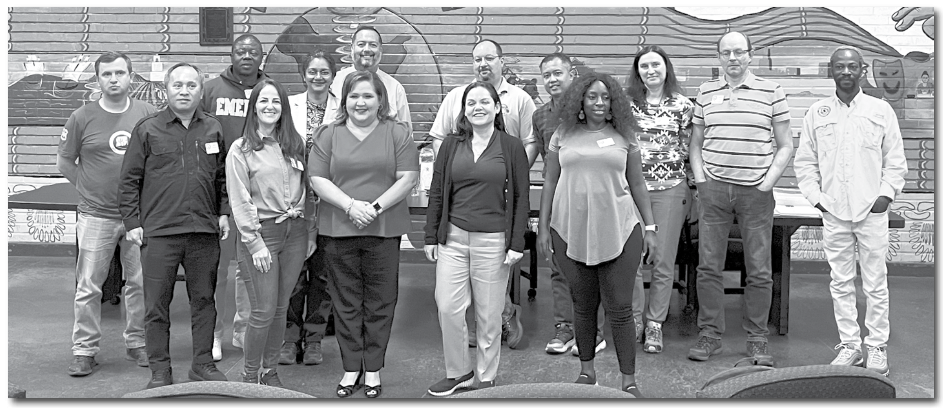
Members of the US Forest Service International Mining Symposium are pictured with officials from the Town of Superior and Resolution Copper during the Symposium's visit to Superior last week.