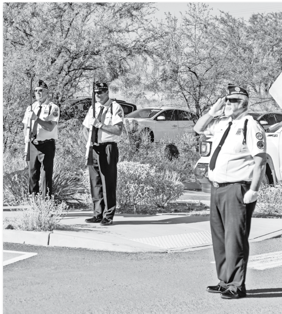
Veterans, volunteers and other officials attended the Veterans Day celebration at the Boyce Thompson Arboretum where the Blue Star Memorial was dedicated.