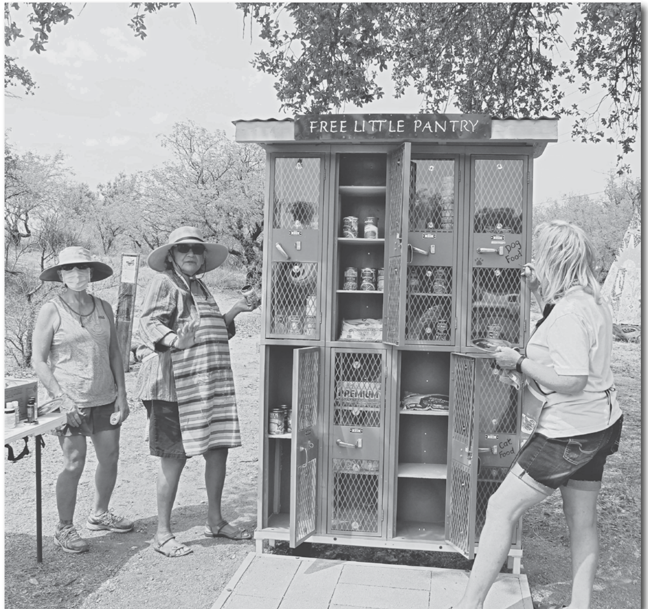
In August 2020, volunteers work to stock the Free Little Pantry. The pantry will be closing for now due to misuse.