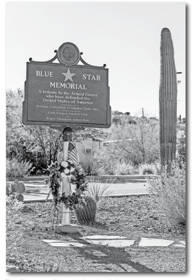
The Blue Star Memorial at the Arboretum was dedicated on Veterans Day.