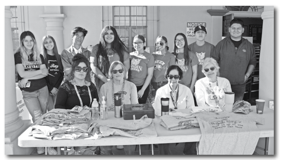
The Copper Basin Chamber of Commerce Board of Directors along with the Junior Chamber of Commerce members who are always a great help at the events. T-shirts for the car show were available for sale.