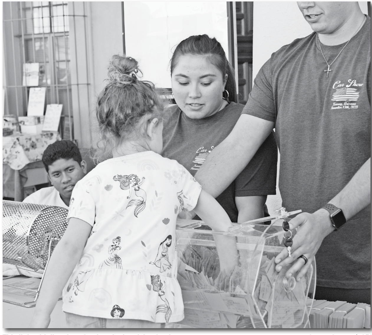
This little girl digs deep for the winning ticket for the car.