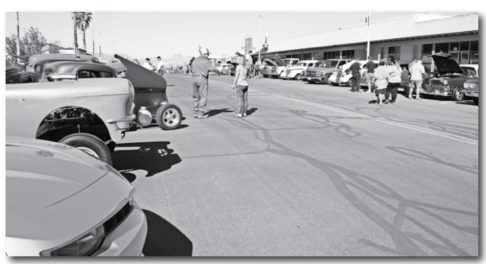
There were almost 100 vehicles that entered the 2021 Kearny Fall Festival Free Car Show last weekend. The weather was perfect with lots of people attending. There were also vendor booths available.