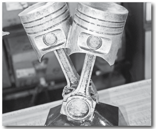
The trophy that was awarded to winners at the car show.