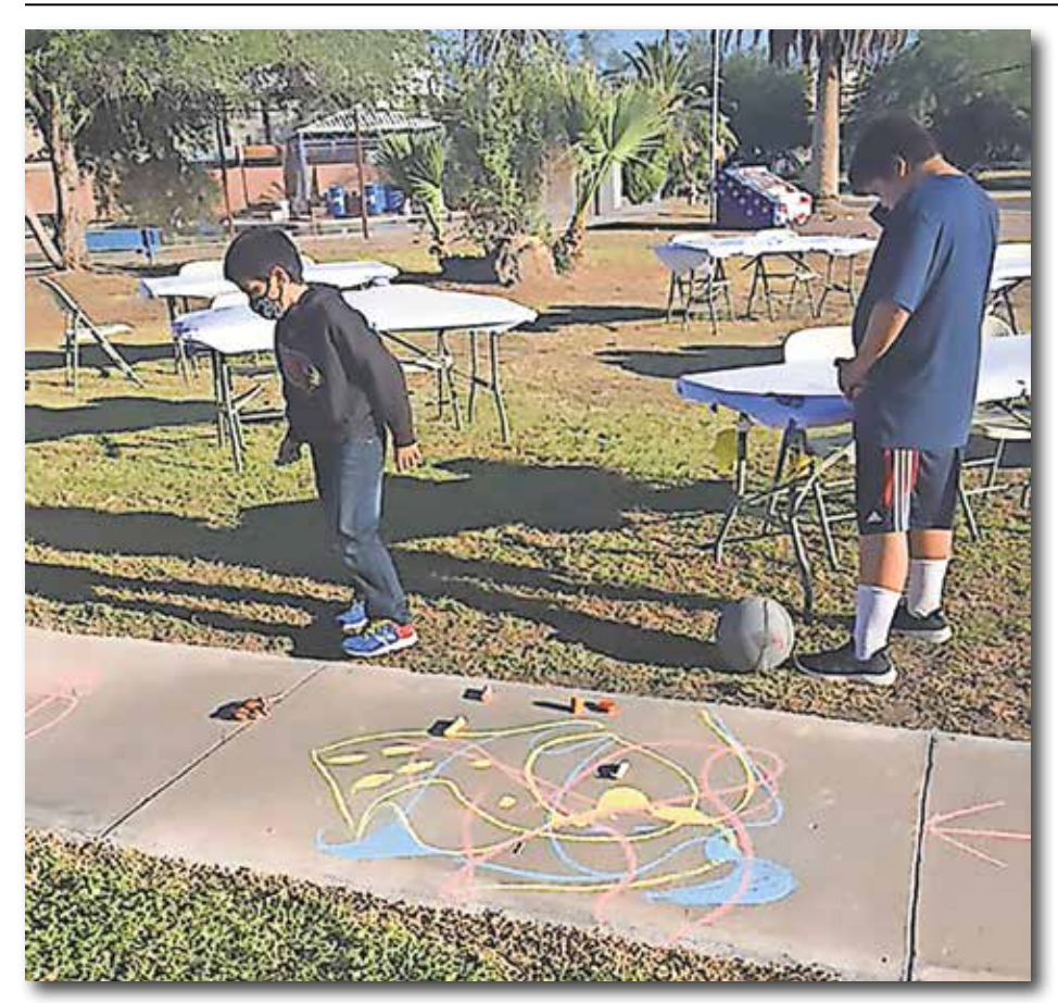
Kids draw on sidewalks and have a fun time at the grand reopening of the Hayden Library.