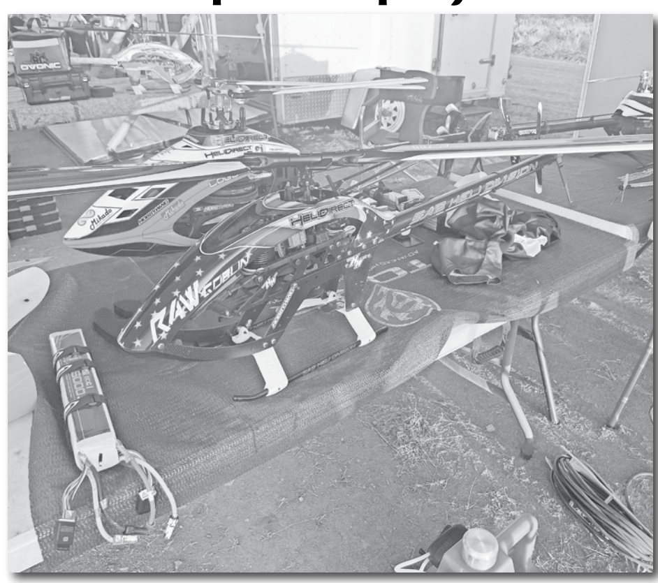
The Superior Airport played host to the annual Southwest Helicopter Rodeo this past weekend. RC enthusiasts with a preference for helicopters descended on Superior and sent their vehicles skyward.