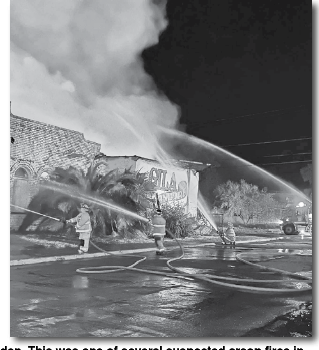
Firefighters from Hayden and neighboring fire departments battle a blaze in the old Gila Furniture Building in Hayden. This was one of several suspected arson fires in the area.