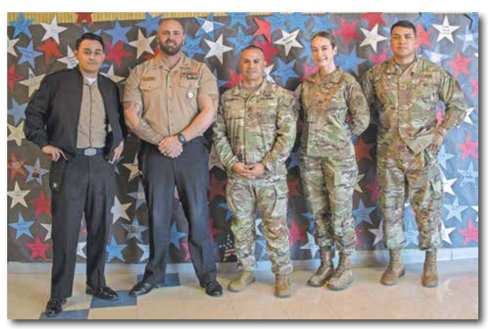
The US Navy and US Army and US Air Force National Guard were honord guests at the Mammoth-San Manuel Schools' annual Veterans assembly last week. The assembly is held to honor local residents who have served or are serving in our nation's Armed Forces.