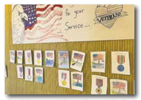
Students at Mammoth-San Manuel PK-12 School decorated the walls outside the school's auditorium with artwork honoring our veterans and military.