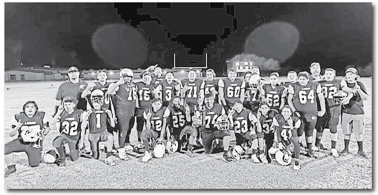
The Hayden High School football team wasn't the only one to win a title this football season. The Jr. Lobos were crowned the champions of the Central Junior High League this year. Congratulations, Jr. Lobos!