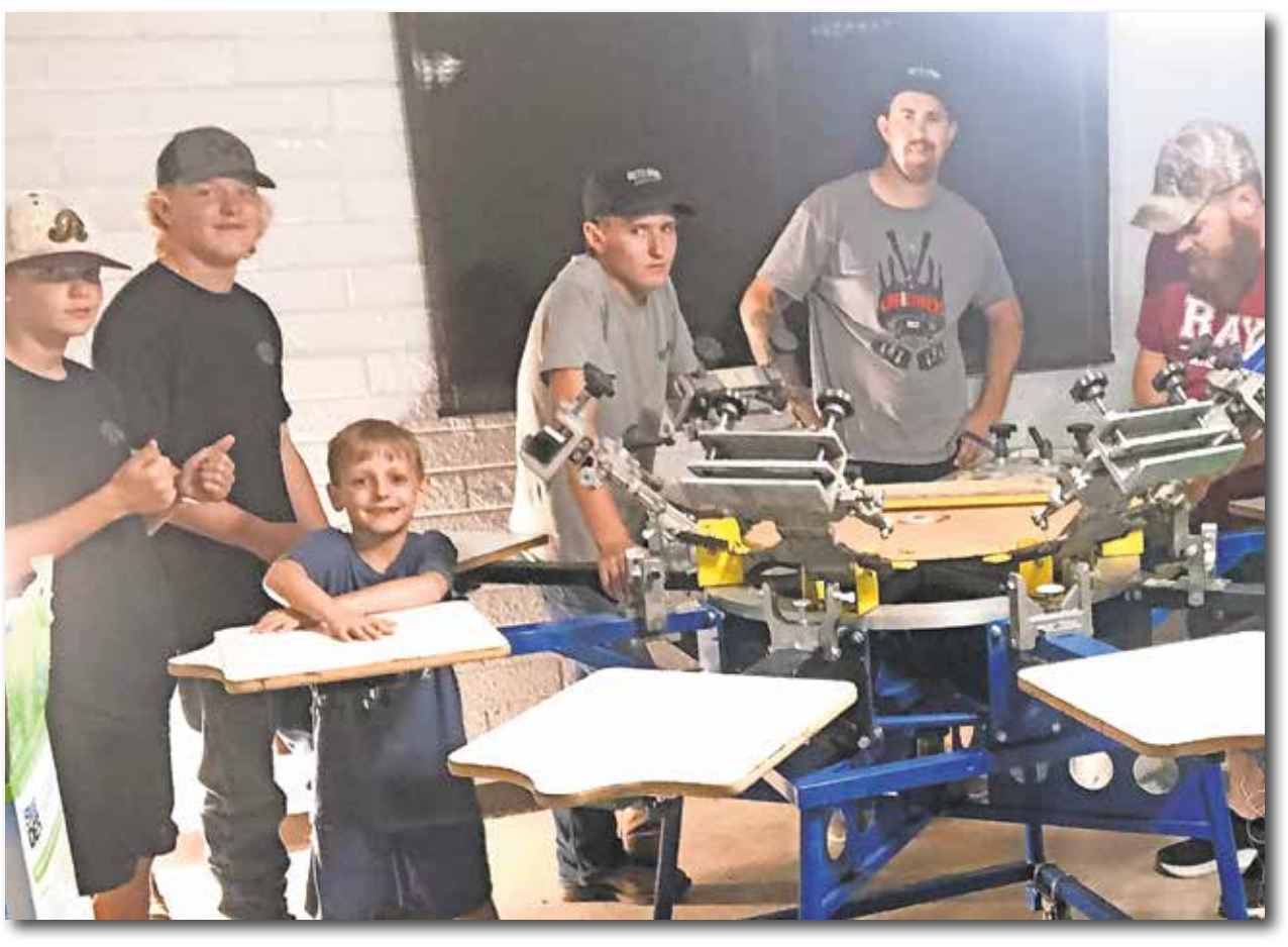
It's a family affair at Mooseknuckle Prints.

Mooseknuckle Prints is located at 1109 Tilbury Dr., Kearny, AZ 85137. Scheduled hours are 8 a.m. to 5 p.m. Lunchtime will vary so if someone is not at the building, please call the shop. Reach them by phone 520-366-4461 or email mooseday1986@gmail.com.