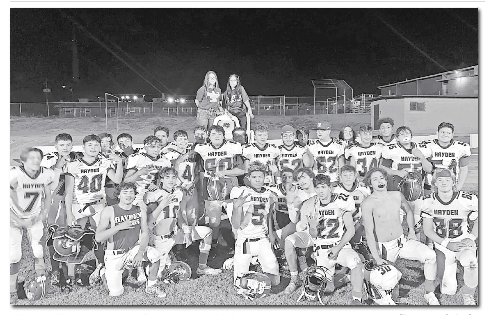
1A East Regional Champions Hayden Lobos will head into the quarterfinals Friday.