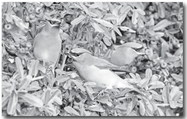
Cedar Waxwings in Pyracantha. Jim Hoagland | Submitted