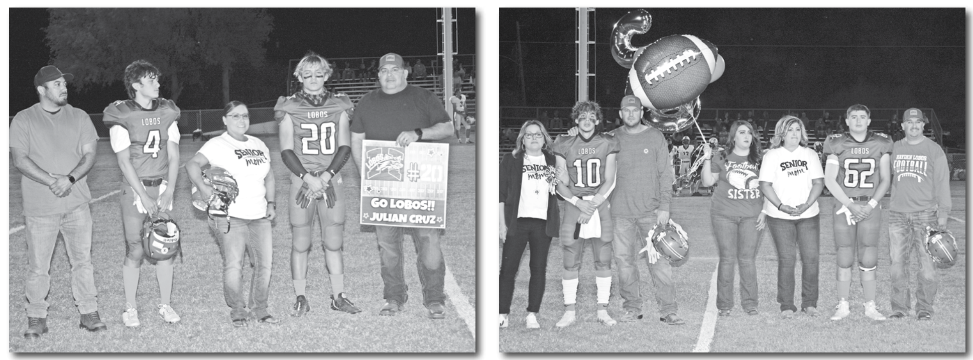
The last game of the season was Senior Night for the Hayden Lobos. Parents were invited onto the field to celebrate with their sons.