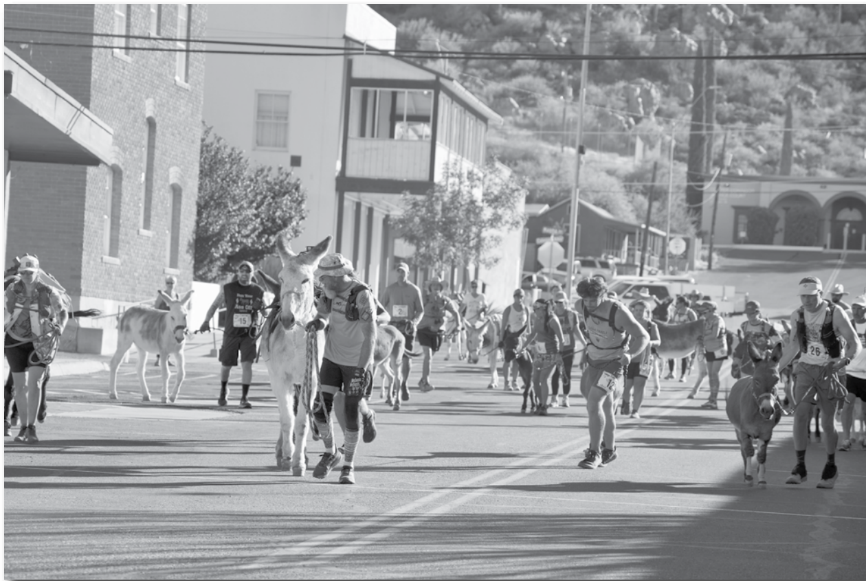
Racers take to the streets of Superior in the annual Jackass Dash.

The day closed out with the Superior Dance company performing and awards ceremony. The award winners and times were not available at press time and will be reported in the Oct. 25 issue.