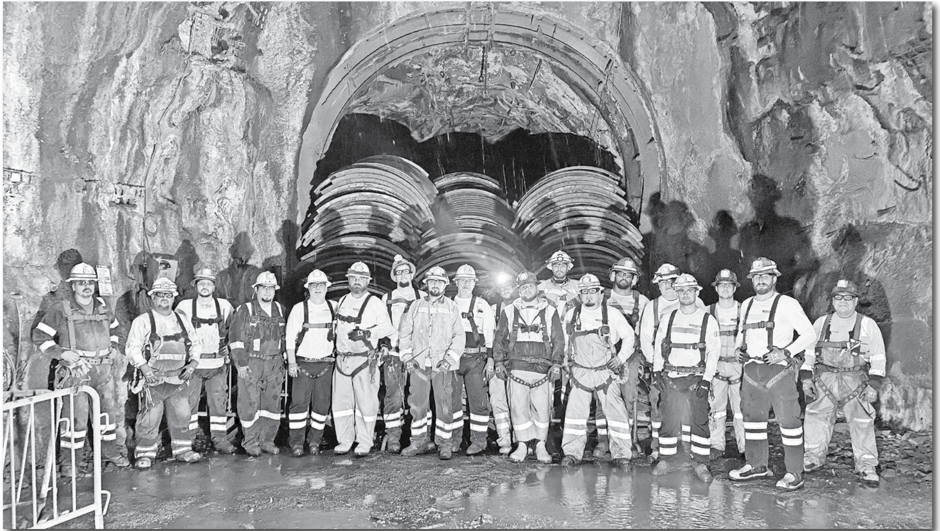
The whole team of local miners pause for a photo after reaching a milestone in the Resolution Copper #10 shaft.