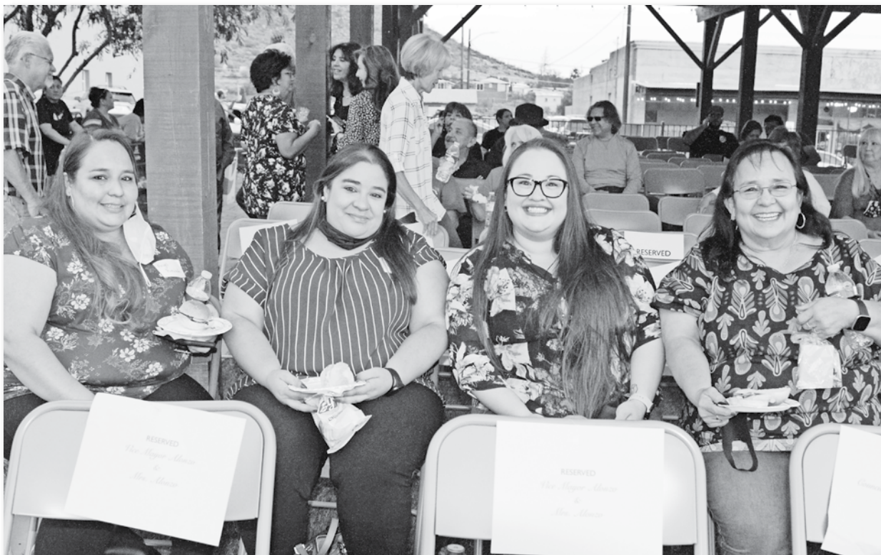
Enjoying some tasty food and excellent company.