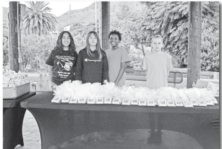
Members of the Superior Junior High Student Council man the goodie table.