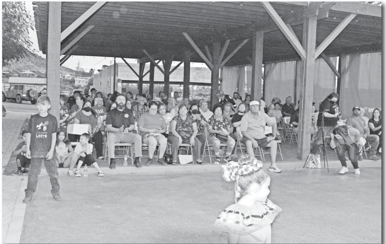
It was a packed audience at the celebration for the 45th anniversary for the town's incorporation.