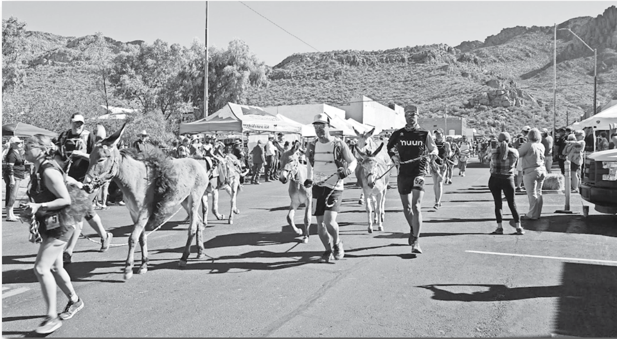
The 2019 Burro Run. The 2021 Burro Run is set for Oct. 23.