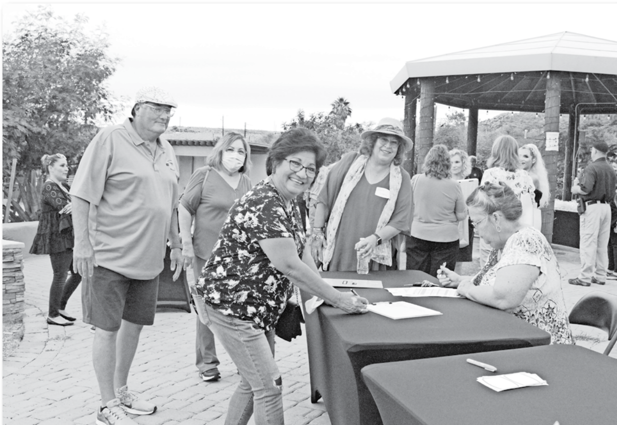
Guests sign in at the table.