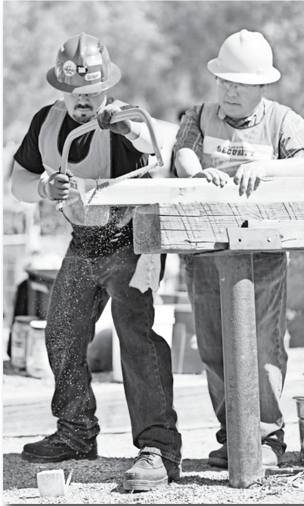
The 2019 Mining Contest at the Apache Leap Mining Festival.