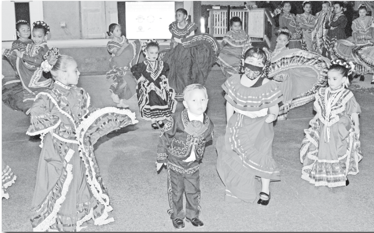
Superior Dance Company performs.