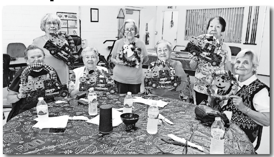
Superior Senior Citizens getting together to make some Halloween wreaths. They had a 'Spooktacular' time!