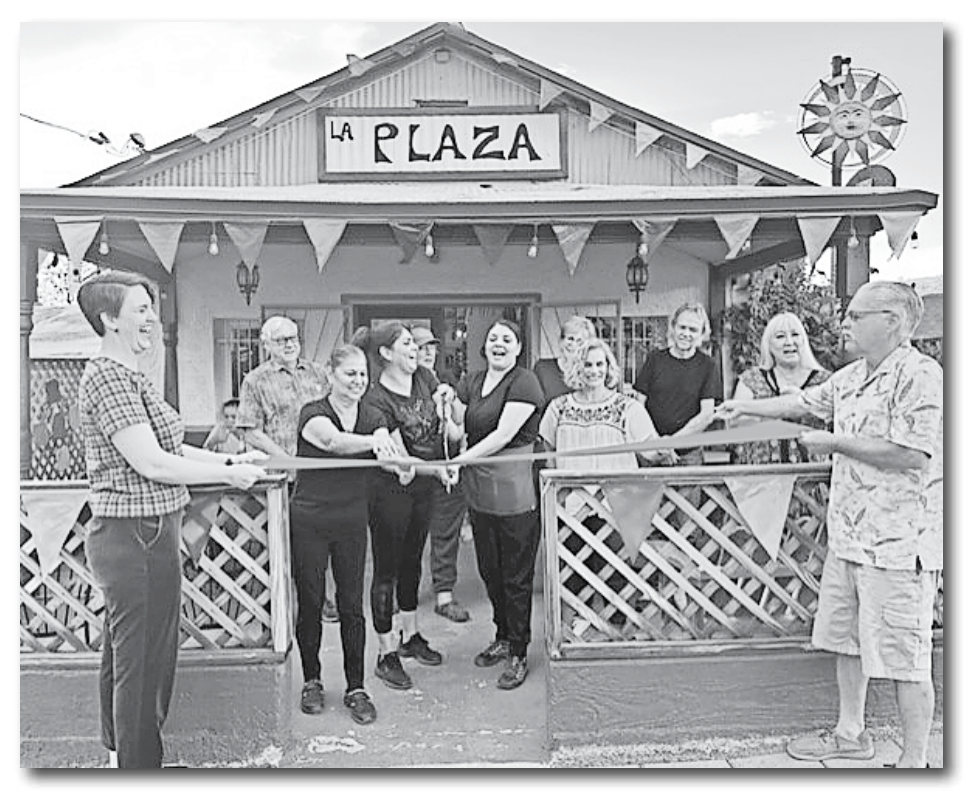
La Plaza Deli & Grill celebrated their grand opening with a ribbon cutting ceremony hosted by the Superior Chamber of Commerce on Friday, Oct. 7. La Plaza is located at 29 N. Pinal Ave. in Superior. The restaurant serves Mexican food and specialties, including a variety of torta, tacos and salads.