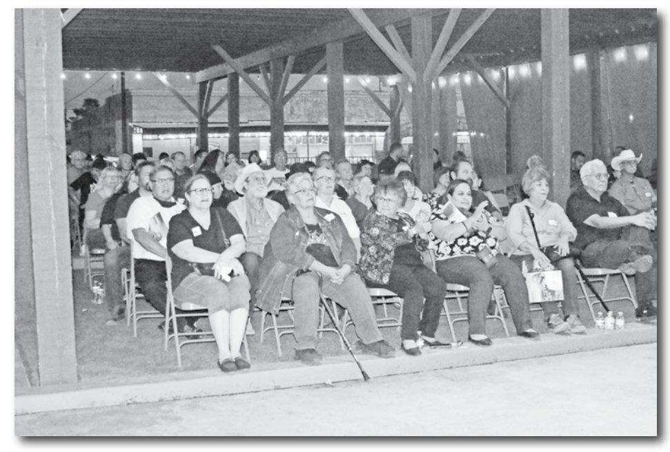
The audience listens with rapt attention at the State of the Town event.