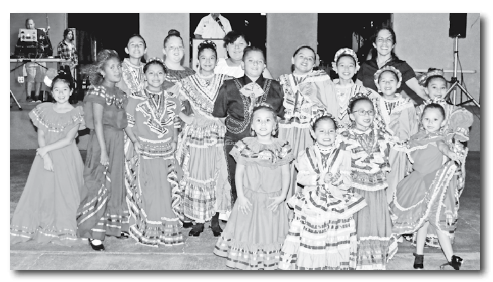
Dancers from the Superior Dance Company were the guests of honor.