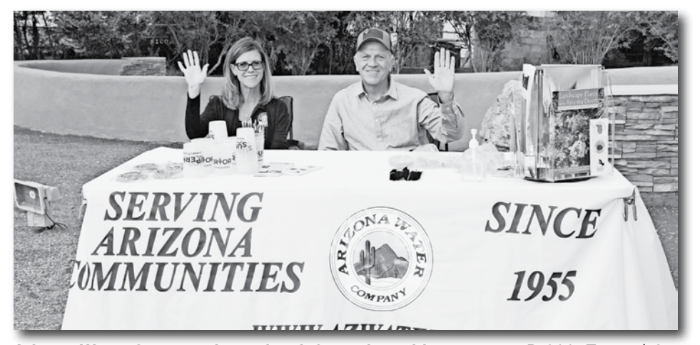
Arizona Water Company hosted an information table.